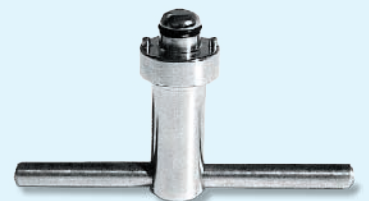
SWIVEL HEAD TOOL