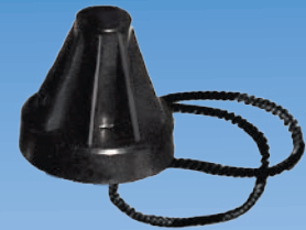
DUST CAP - YOKE