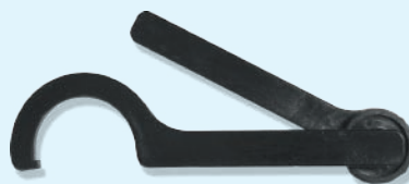
BCD TOOL R.E. DUMP VALVE