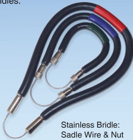
Stainless Bridle: Saddle Wire & Nut