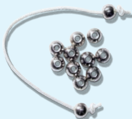
Dyneema Bridle Balls